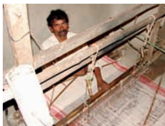
Traditional skills need new markets